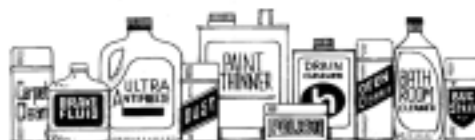
Adapted from Home*A*Syst, An Environmental Risk-Assessment Guide for the Home

Signal words such as danger , warning and caution refer to human safety information. These words relate to the effects of the products on human health. Products labeled danger are the most hazardous and may be extremely flammable, corrosive, or toxic. Those products labeled caution are the least hazardous. Other words that give clues to products containing potentially hazardous ingredients are the following: irritant, use with adequate ventilation, combustible, caustic, volatile, flammable, avoid inhaling, poison, vapor harmful, and fatal if swallowed. On some labels, these signal words are listed under "precautionary statements." Precautionary statements list hazards to human health, animals, and the environment. Also, they give information regarding the steps you should take to minimize exposure to products.